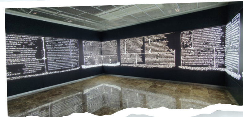
COMMAGENE CULTURE CENTER